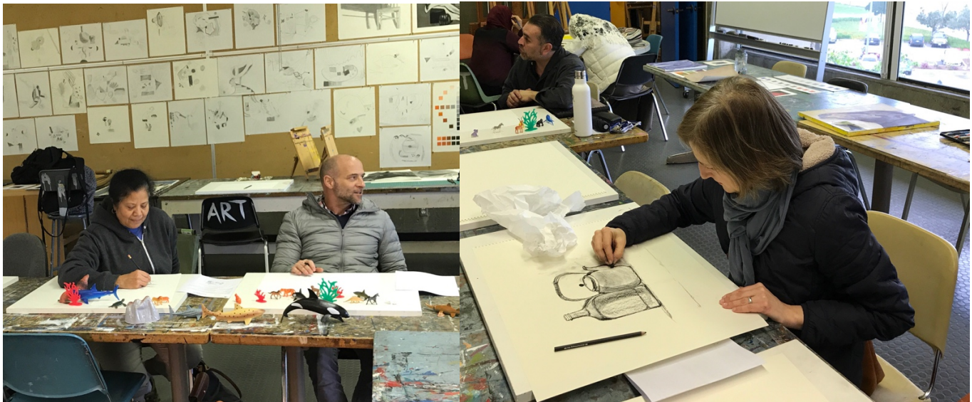
CoA Art Encounters participants find inspiration in a group art setting