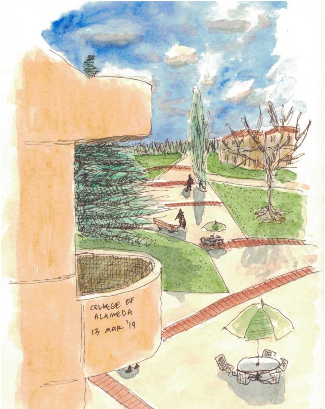
Drawing of CoA Campus by COA English Instructor Jay Rubin

The mission of the College of Alameda is to serve the educational needs of its community by providing comprehensive and flexible programs and resources to empower students to achieve their goals.