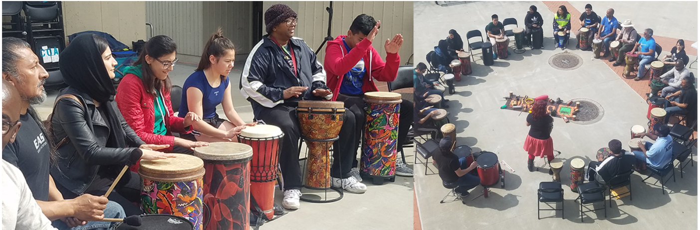
The recent drum circle at CoA was very popular with students, faculty, and staff.