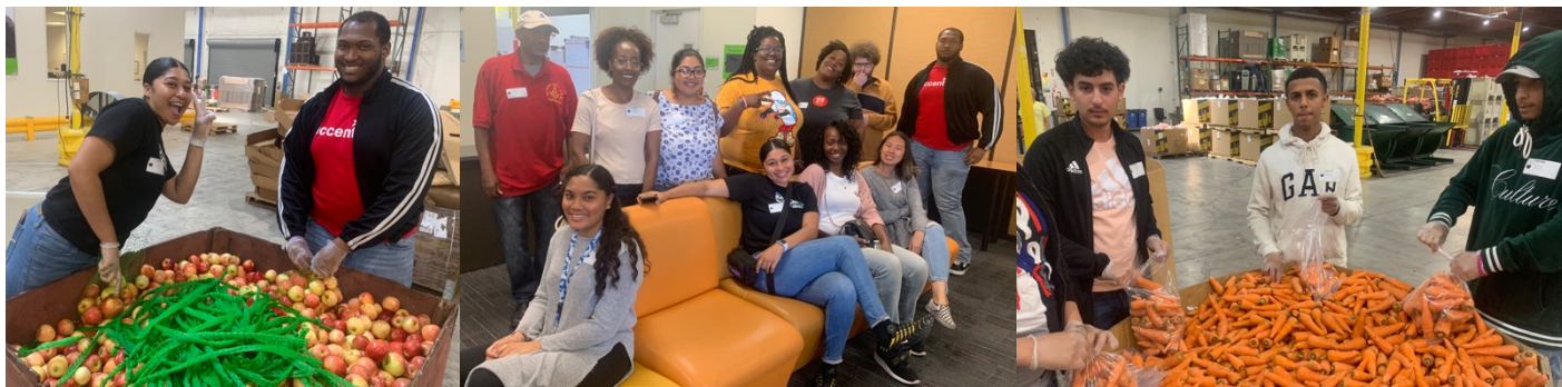
CoA Umoja Scholars Volunteer at the Alameda County Food Bank