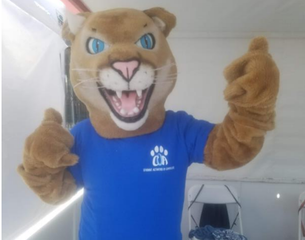
The CoA Cougar poses at the Downtown Alameda's 35th Annual Art & Wine Faire in July.