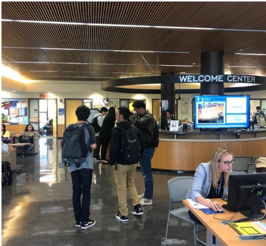
Students in line to see a counselor on drop ins.; over 400 students served in the first week of the semester.