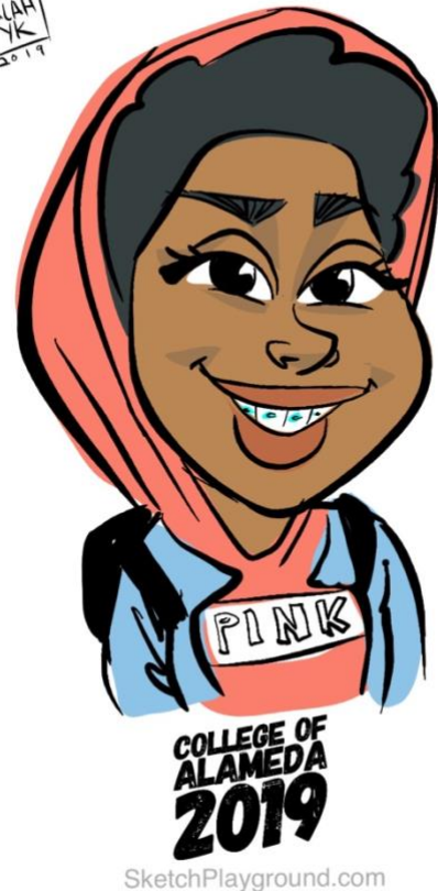
Digital caricature by Sketch Playground,