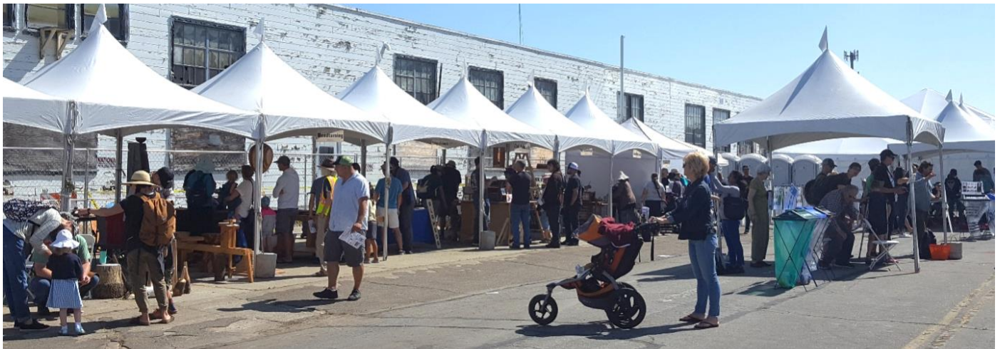
Alameda Mini-Maker Faire at Alameda Point, August 11, 2019

CoA was honored with a “SMART” partner ward by Girls Inc. at their annual award ceremony in July. I had the pleasure of accepting the award on behalf of the college.