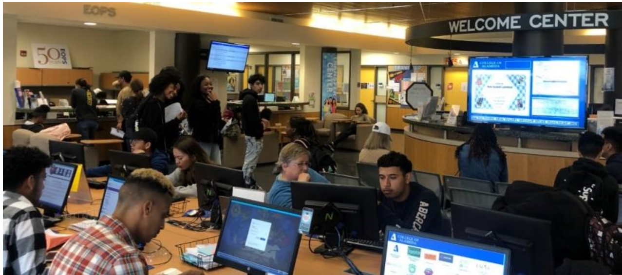
Students being assisted with accessing Canvas, Peralta Student Email account, Peralta Passport, OpenCCC, and FAFSA