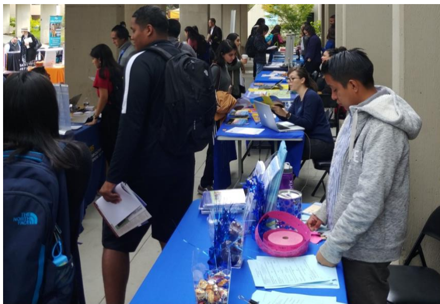
Photo of Transfer Day 2018

Transfer Day is an opportunity for prospective transfer students to meet and gather information from CSU, UC, private, and out-of-state colleges and universities.