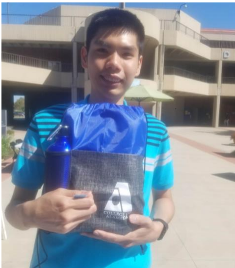
GradGuru raffle winner claims his CoA Swag pack during Welcome Week.

Anyone who is interested in sharing materials with their community is welcome to stop by the Outreach Office, located at L235 (behind the elevator) to pick up a marketing materials packet.