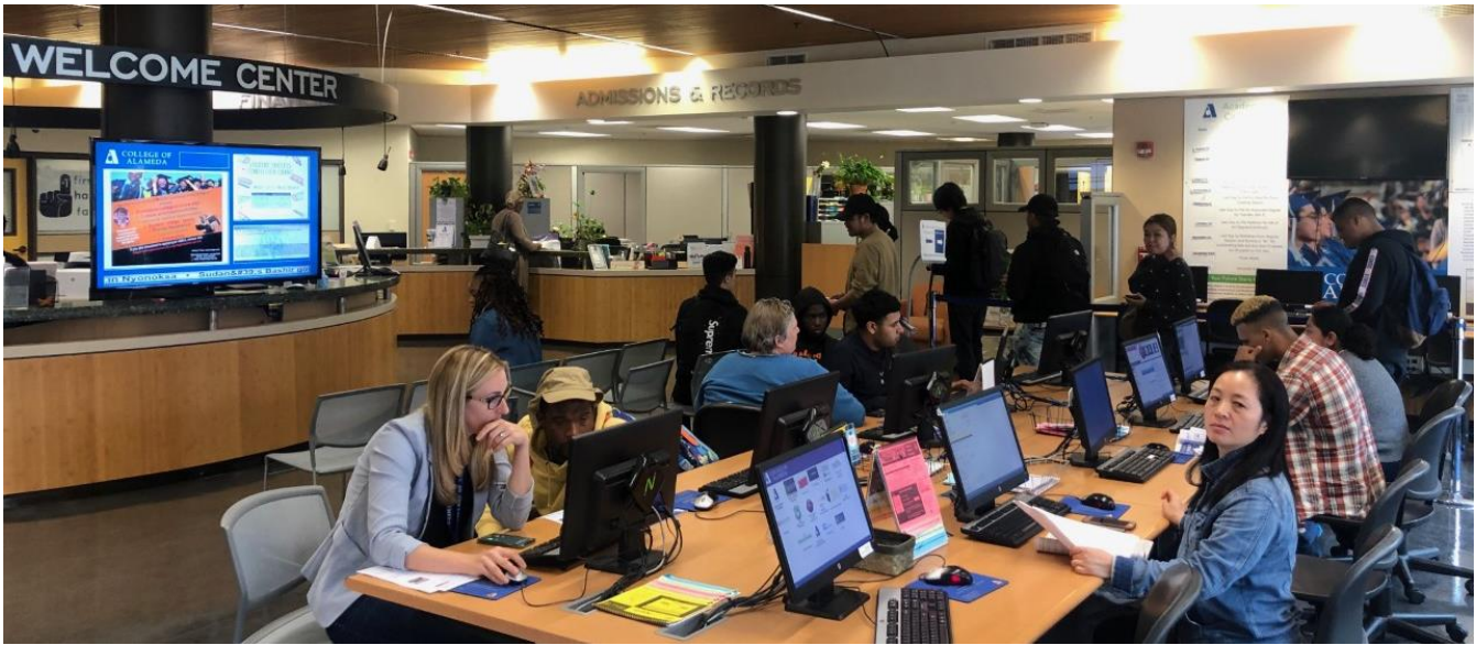
Students being assisted with accessing Canvas, Peralta Student Email account, Peralta Passport, OpenCCC, FAFSA