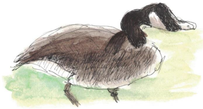
Illustration by Jay Rubin, COA English Instructor

Another possibility is that without time in remedial and developmental courses, students may need more coaching in discipline-specific reading, writing, and study skills. With this scenario in