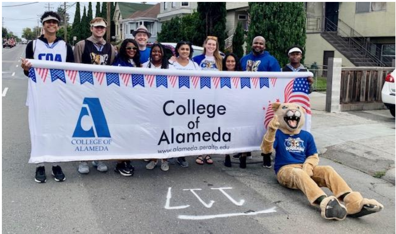
CoA representatives and our Cougar Mascot at the Alameda Fourth of July Parade

Please take a quick survey to help choose the TLC's new name. Please use this link to the survey: https://www.surveymonkey.com/r/XG6DXF3