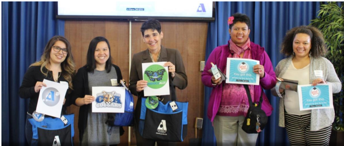
Community Partners show off their raffle prizes at the Annual Community Partner Breakfast.