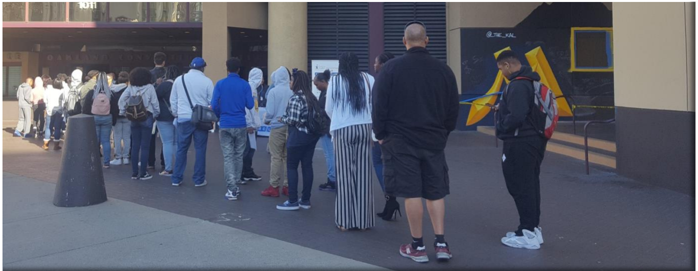
Participants at the registration line for the Annual Black College Expo at the Oakland Marriott on Saturday, February 17, 2018.