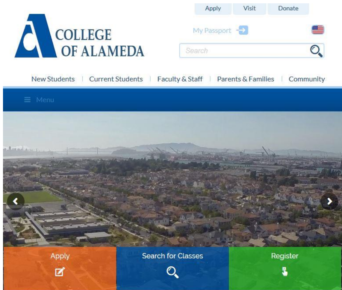
Screenshot of a preview of College of Alameda's webpage design.

The mission of the College of Alameda is to serve the educational needs of its community by providing comprehensive and flexible programs and resources to empower students to achieve their goals.