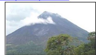
Arenal Volcano