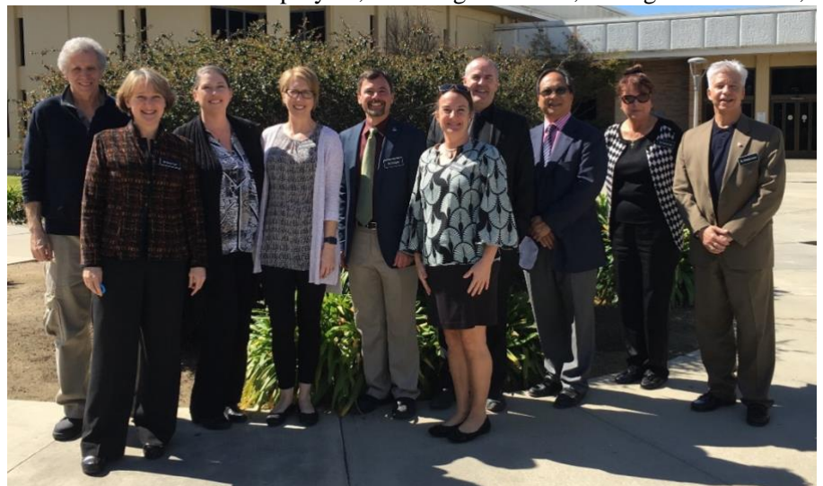
ACCJC evaluation team to Reedley College and Madera and Oakhurst Centers.