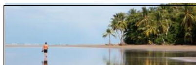
Marino Ballena National Park