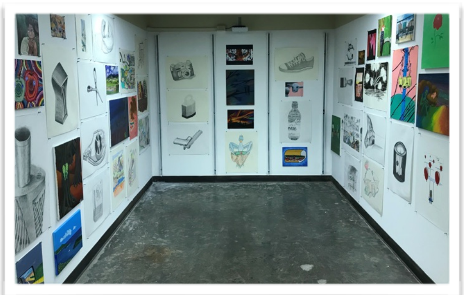
CoA Furnace Gallery Student Show Fall 2017