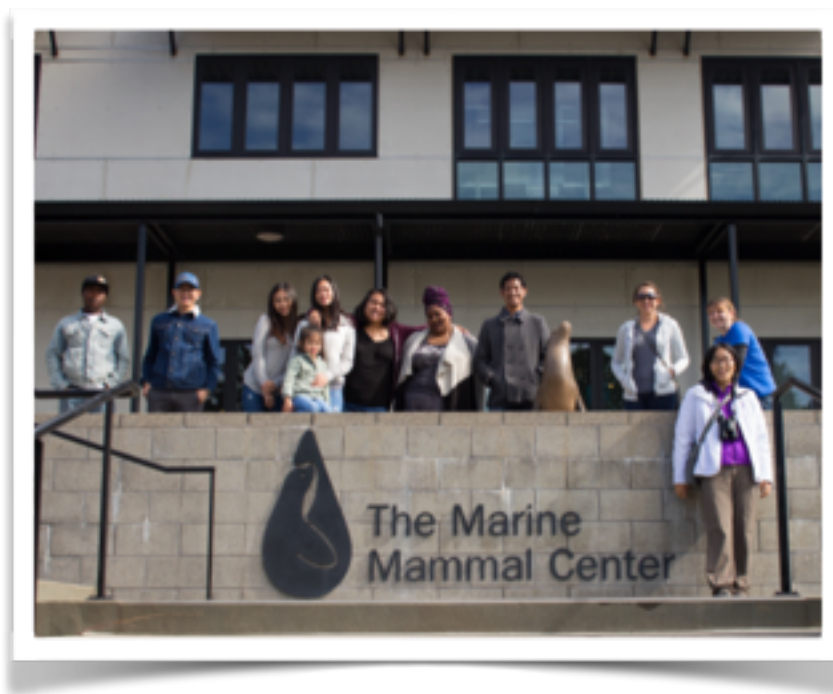
CoA Science Alliance club members outside the Marine Mammal Center on February 25, 2017. The center is dedicated to marine mammal rescue, rehabilitation, scientific research, and education. A highlight of the trip was seeing (and hearing) rescued elephant seal pups.