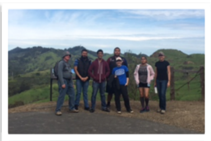
CoA Science Alliance club members on the main trail at Sibley Volcanic Regional Preserve on March 19, 2017. The park is home to a complex volcanic center and lava debris that formed 10 million years ago. Other features of the park that were discussed include tectonic faulting in the area and sedimentary rocks from the Orinda Formation.