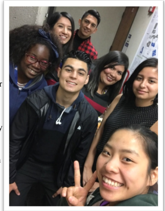
Outreach and Retention Department members pose for a group photo outside of the Outreach Office at L235.