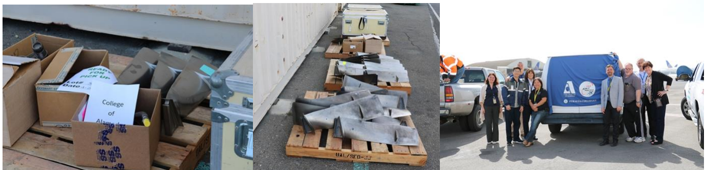
United Airlines recently donated engine blades, metal honeycombs, and other parts to CoA's Aircraft Maintenance Technology Program