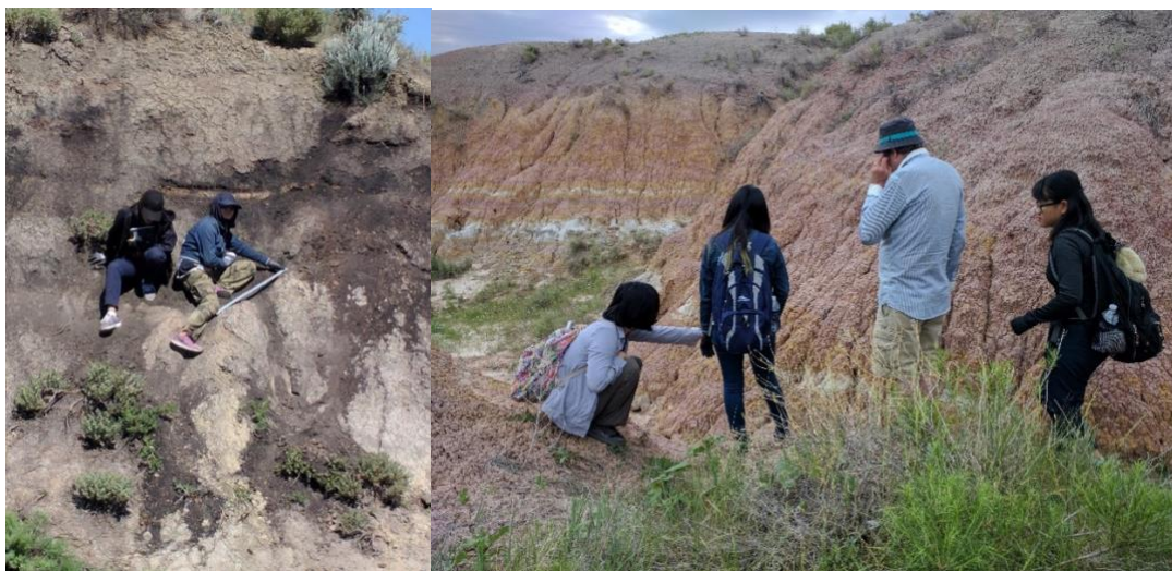
2018 Expedition: Left-Students at work measuring normal fault properties in the "Z-Coal" at the Lerbekmo K-Pg boundary site off Hell Creek Marina Road north of Jordan, MT. Right-Students looking at colorful stratigraphic layers in Badlands National Park, SD.