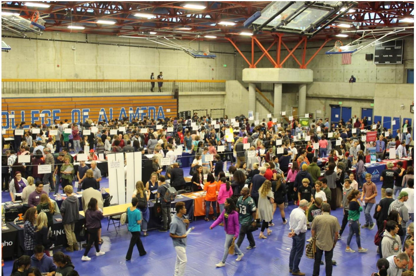
CoA's gym was full of enthusiastic students for Citywide College Night on Tuesday, October 2, 2018.