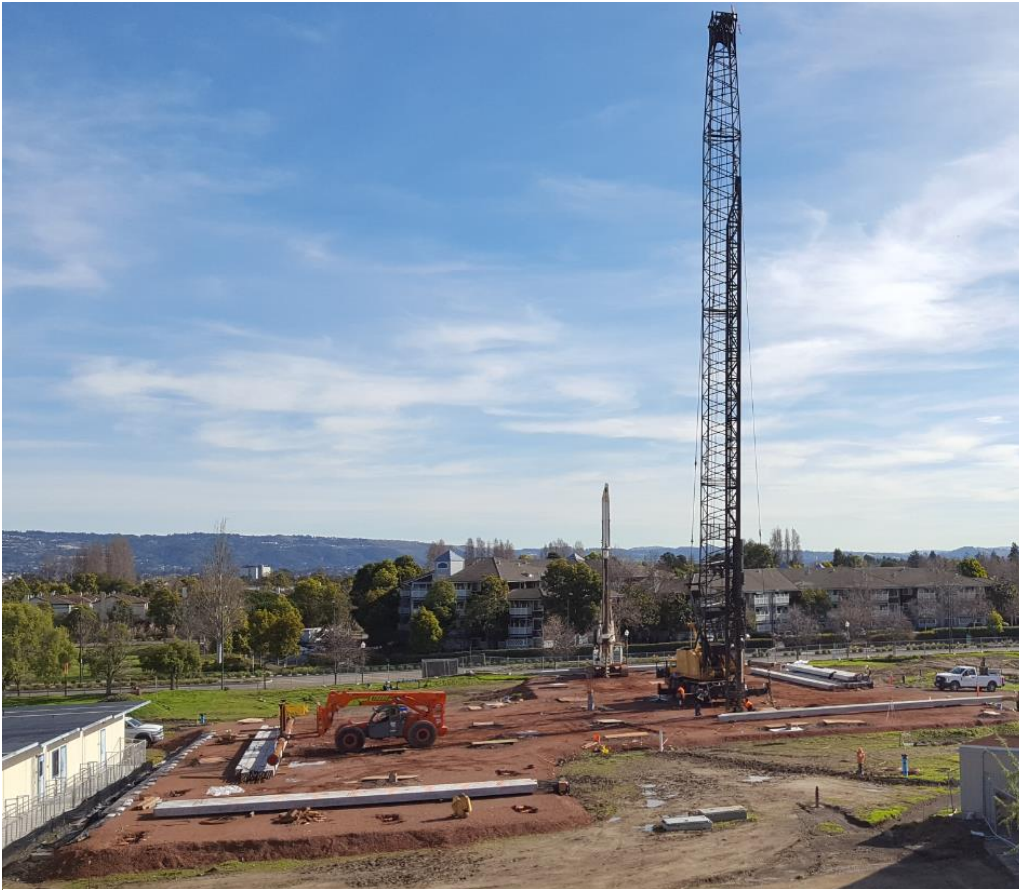
Construction of College of Alameda's New Center for Liberal Arts Building begins active phase.

Over the winter break the New Center for Liberal Arts Building moved to a new phase... pile driving. Over approximately two and a half weeks piles were driven into the ground using a very large crane. The new structure will rest on these foundation piles. The next, less noisy, phase will be the laying of the foundation. This should begin soon. In early spring the steel building frame will be delivered and installed. By summer 2019 we will have the shell of the final building in place.