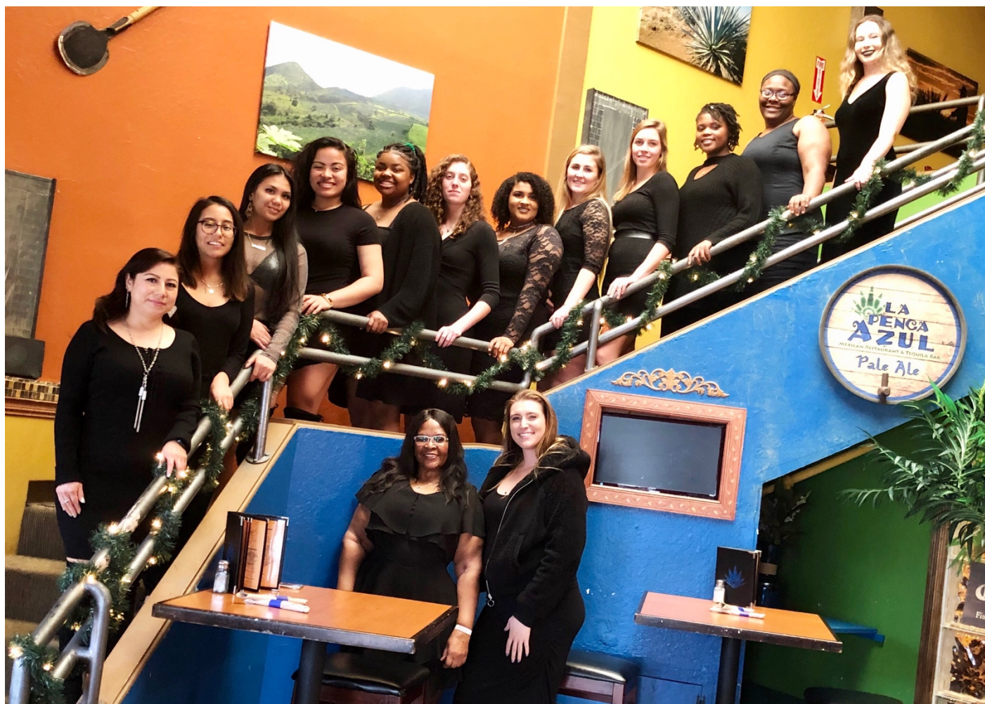
College of Alameda Women's Volleyball Team at the 2018 Team Awards Luncheon, Thursday, December 6, 2018.