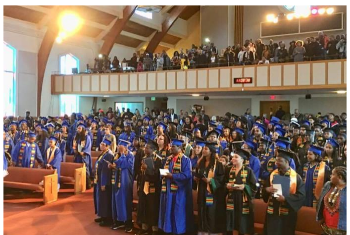
Peralta African/African-American Graduation

The mission of the College of Alameda is to serve the educational needs of its community by providing comprehensive and flexible programs and resources to empower students to achieve their goals.