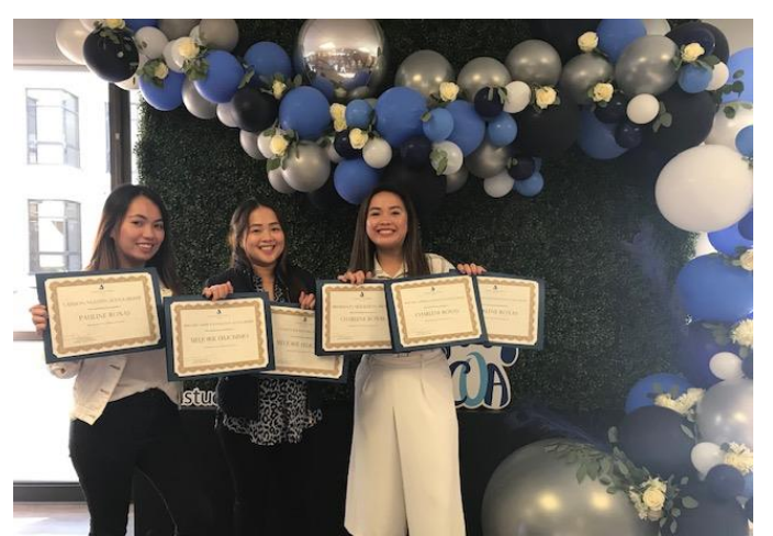
Student Scholarship and Transfer Event