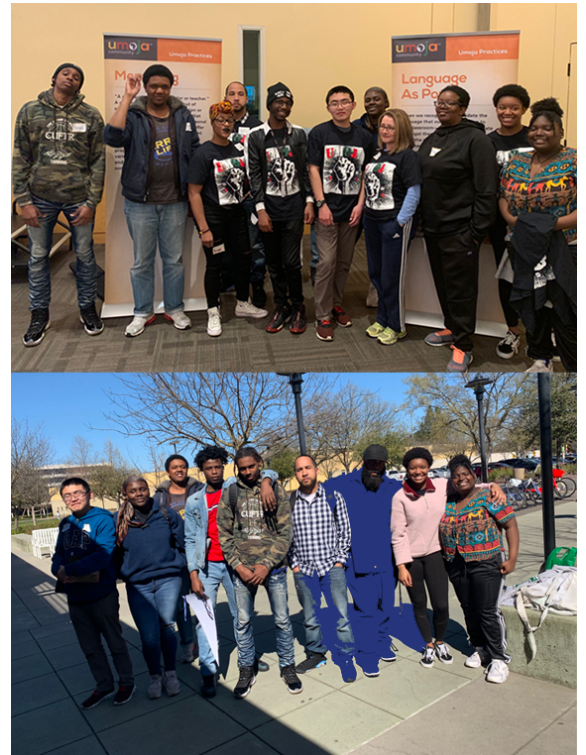
On March 15, 2019, CoA UMOJA students attended the Umoja Regional Symposium at UC Davis

CoA 2019 Commencement will be held at the College of Alameda Soccer Field.