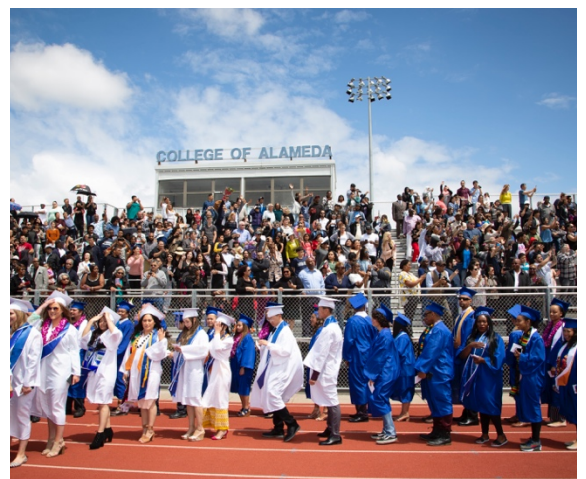
College of Alameda Commencement will be May 24, 2019