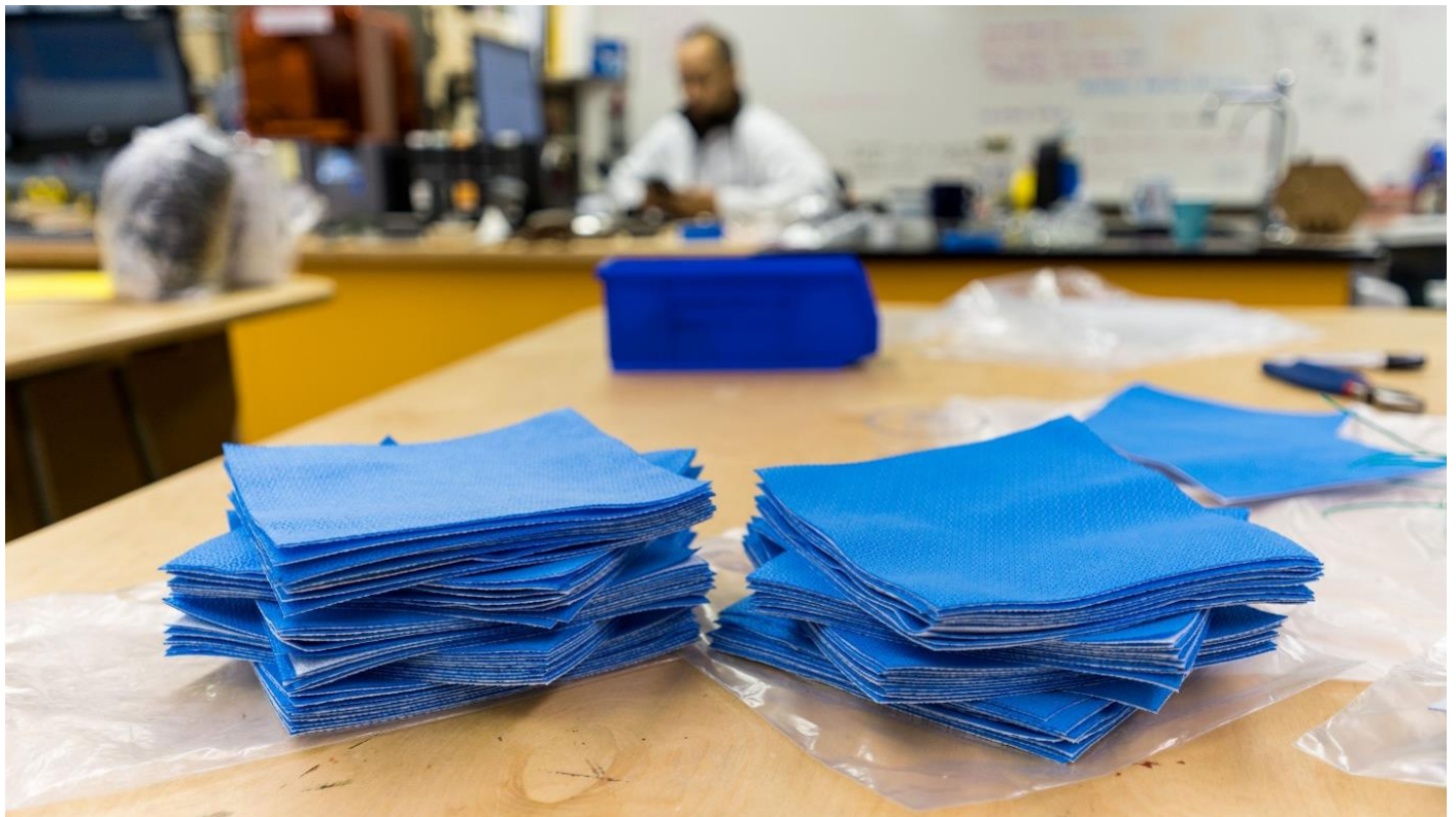
FabLab and CoA's Apparel Design and Merchandising (ADAM) students join the fight against COVID-19 volunteering to make PPE