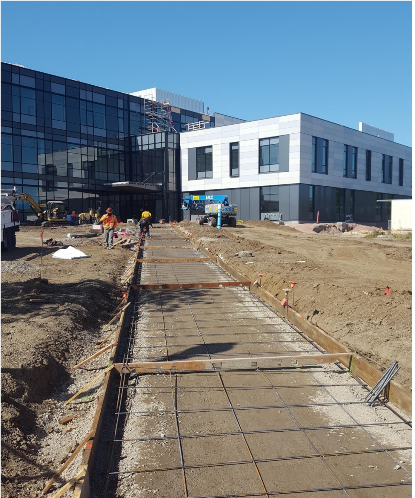
New walkway in progress at the New Center for Liberal Arts building.