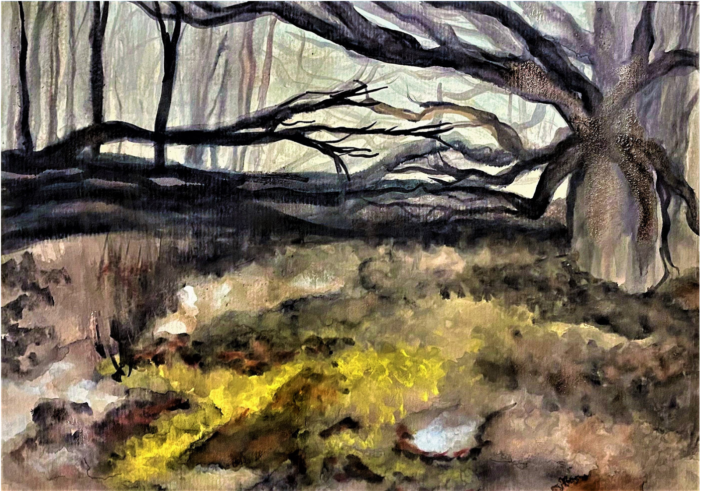
Watercolor titled The Woods by CoA Art Student Christina Fine.