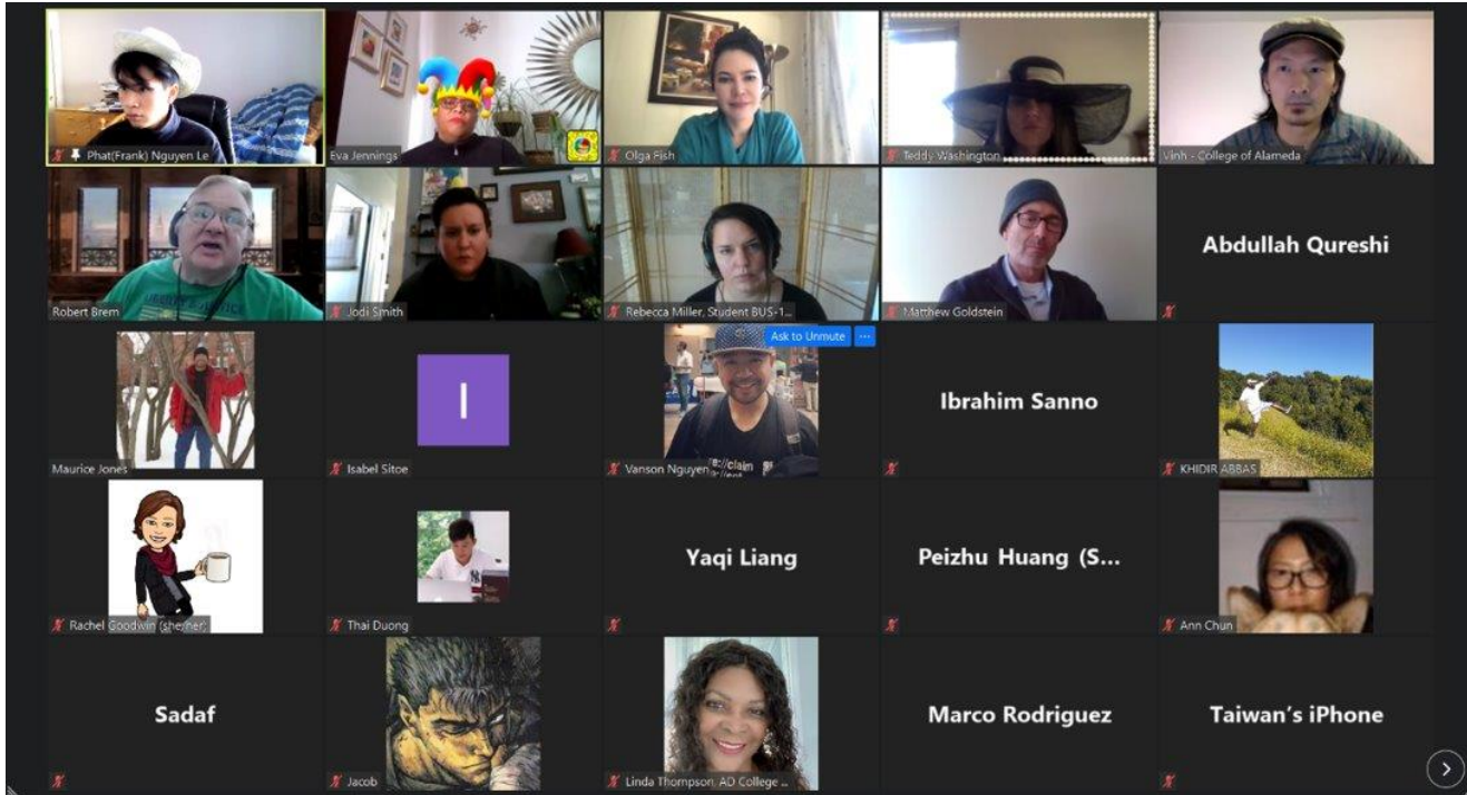
Image: CoA Guided Pathways Team virtual celebration.